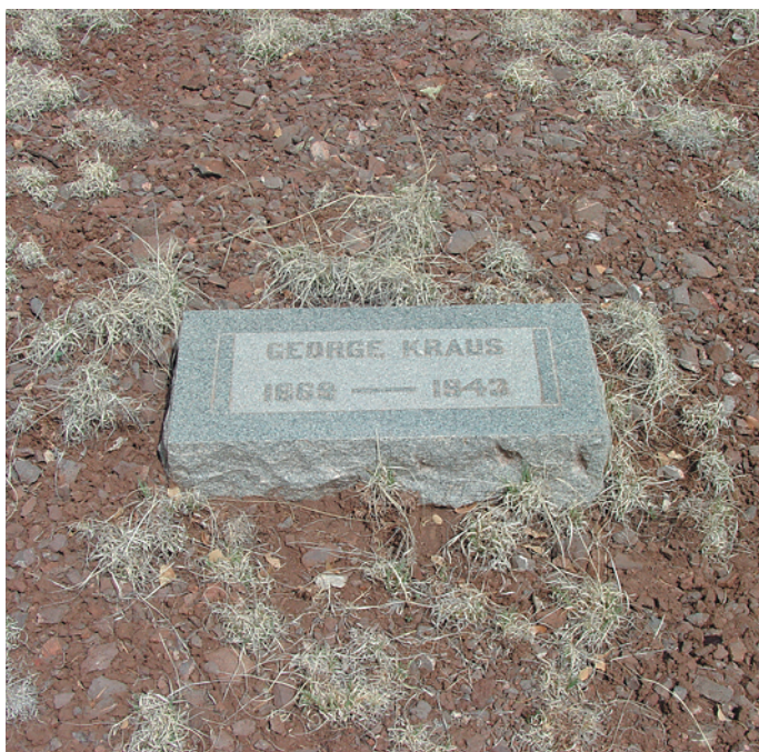
View 1 — Main (front)