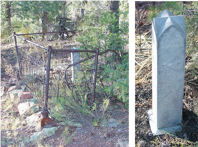
View 1 — Main (front)