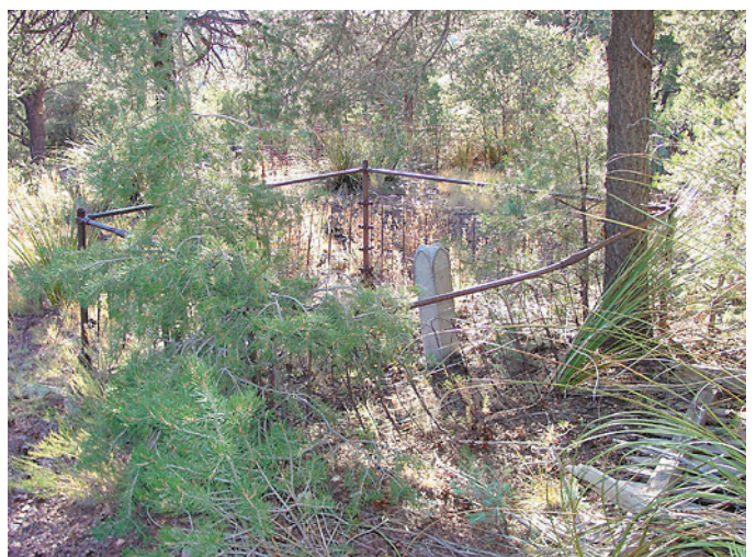
View 4 — Side (right)