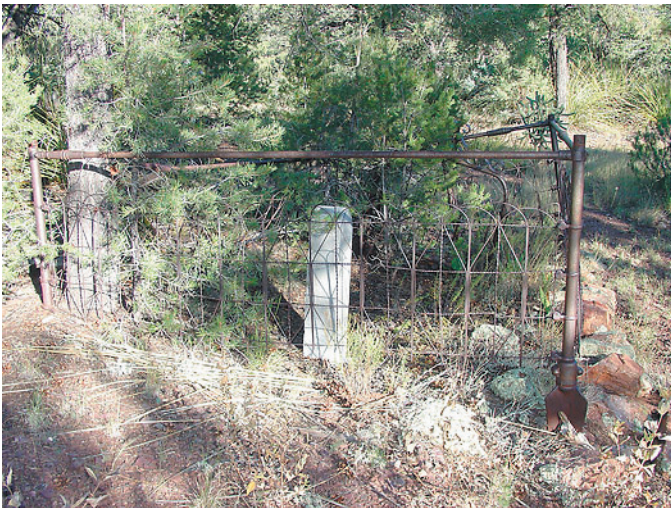
View 3 — Back