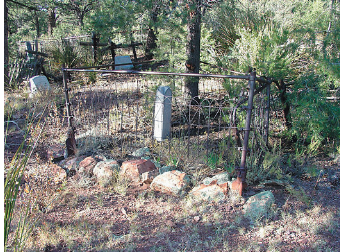
View 2 — Side (left)