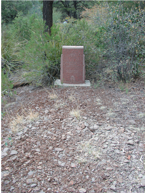
View 1 — Main (front)