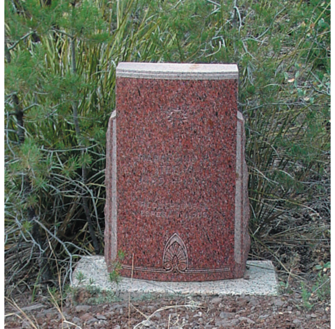
View 2 — Side (left)