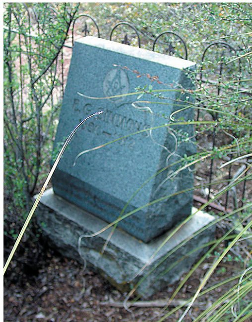
View 2 — Front (close)