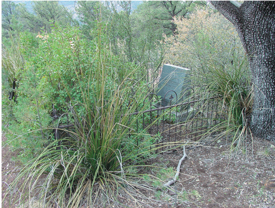
View 1 — Main (front, right )