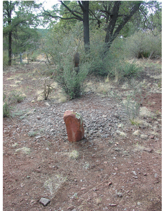
View 2 — Main (front)