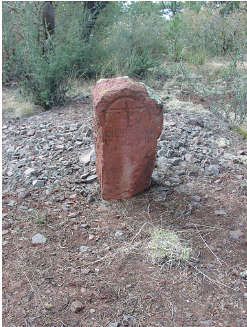
View 1 — Main (close)