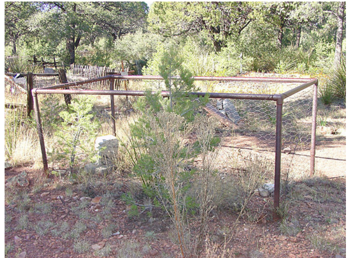
View 2 — Side (left)