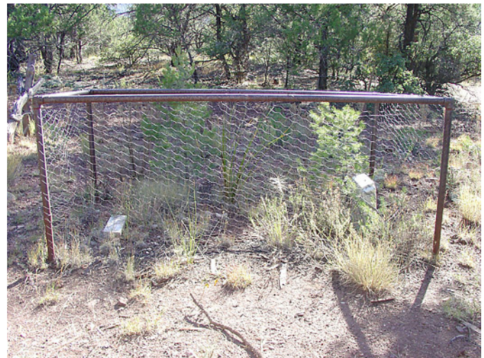
View 4 — Side (right)