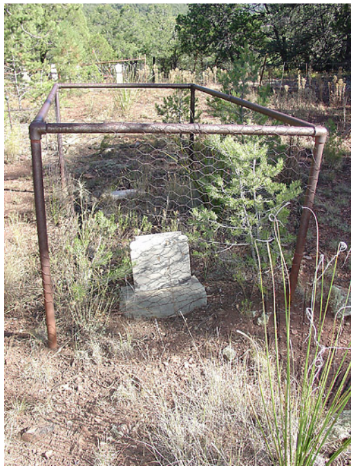
View 3 — Back