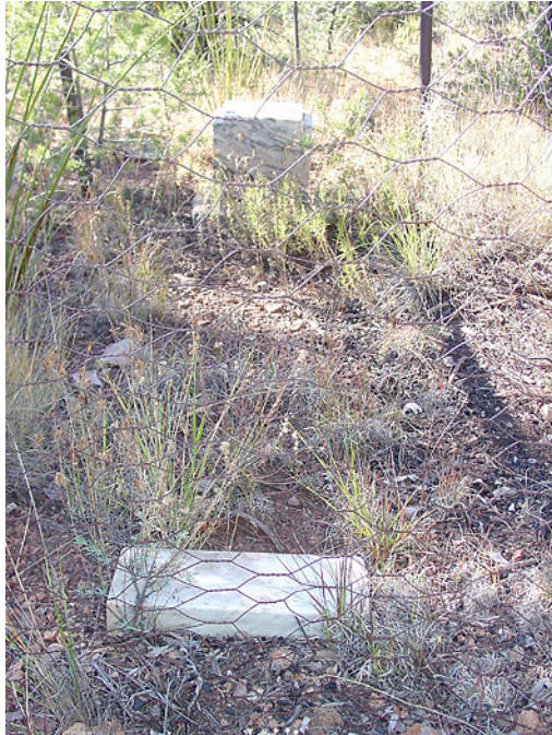
View 1 — Main (front)