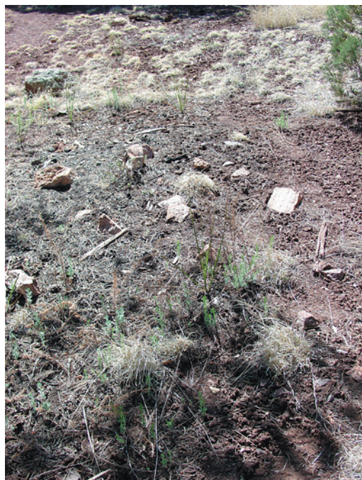
View 1 — Main (front)