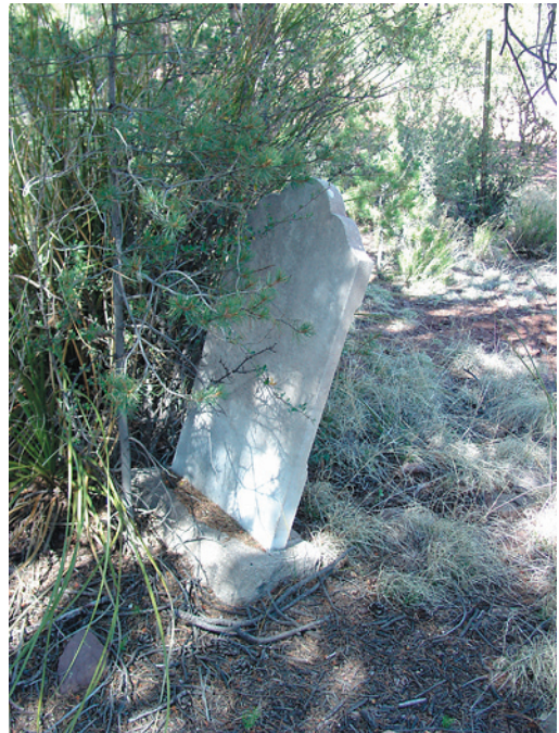
View 2 — Side (left)