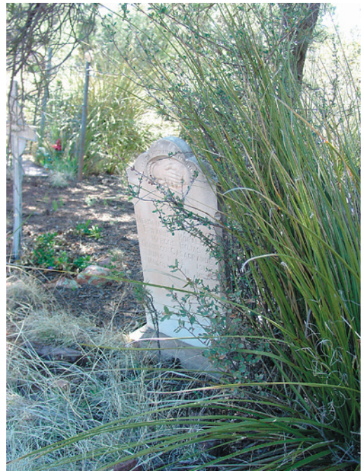
View 4 — Side (right)