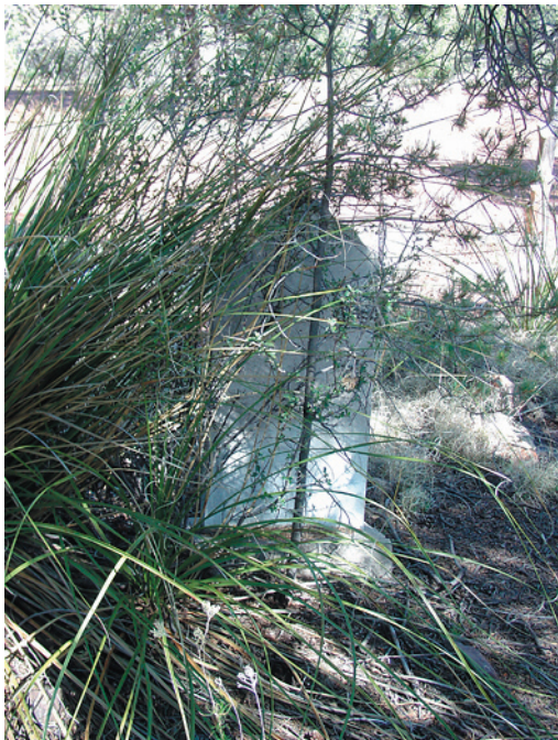
View 3 — Back