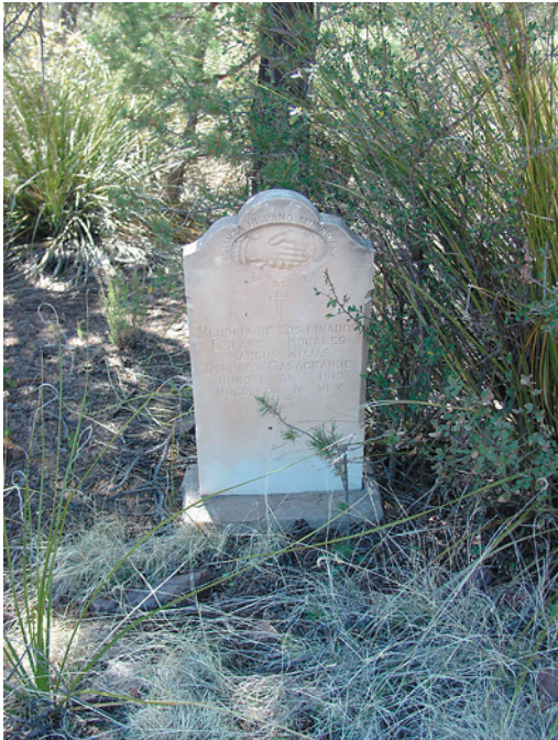
View 1 — Main (front)