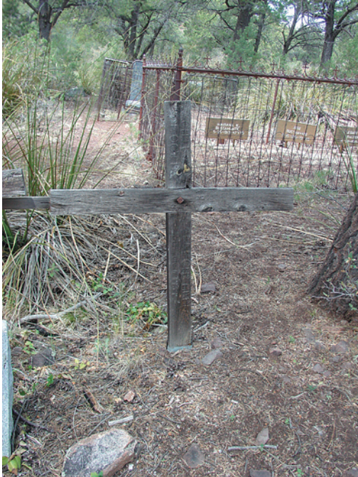
View 1 — Main (front)