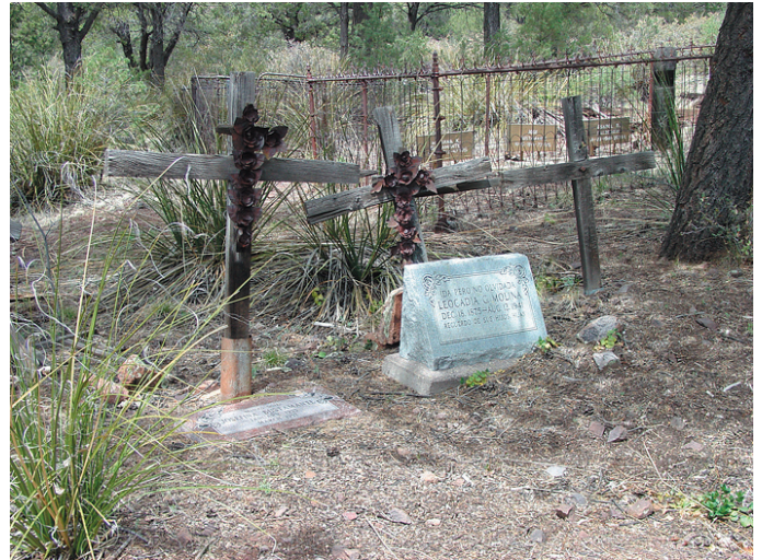
View 2 — Front (group)