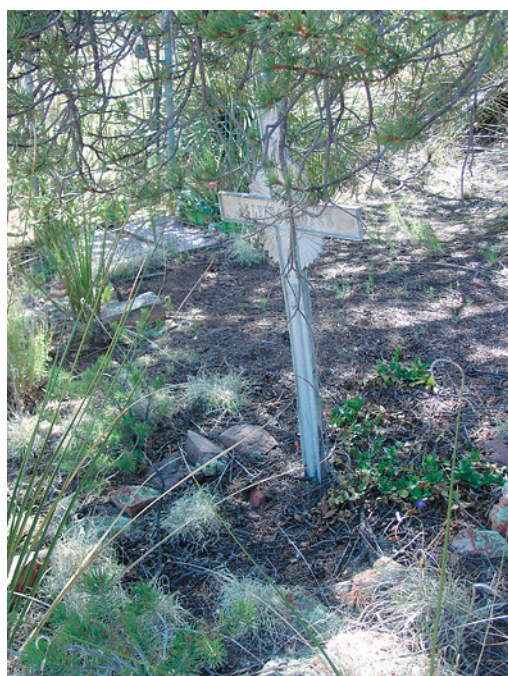
View 4 — Side (right)