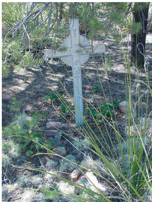
View 1 — Main (front)