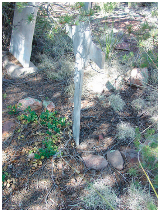
View 2 — Side (left)