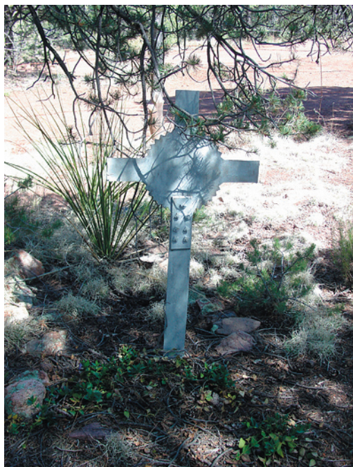
View 3 — Back