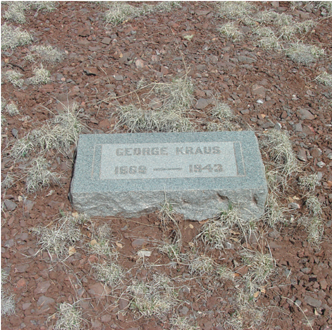
View 1 — Main (front)