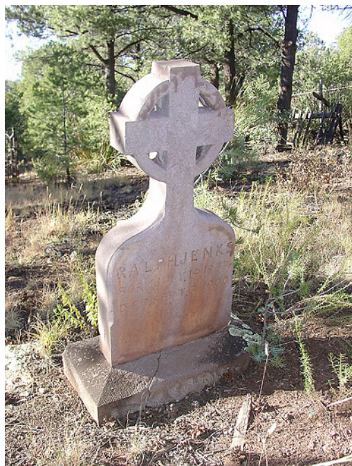
View 1 — Main (front)