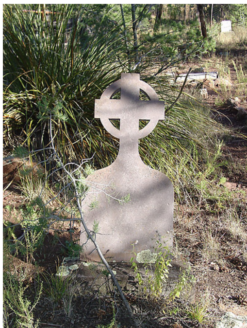
View 3 — Back