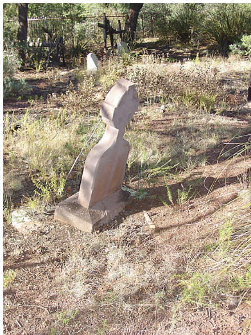
View 2 — Side (left)