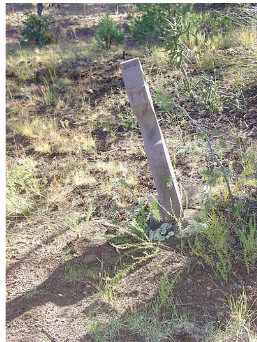
View 4 — Side (right)