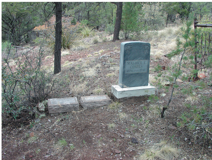
View 1 — Main (front)