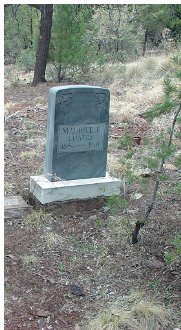
View 2 — Main (close)