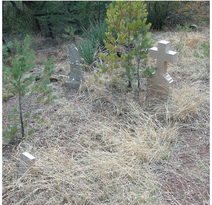
View 2 — Front (right)