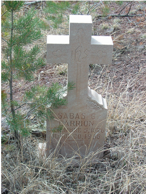
View 1 — Main (close)