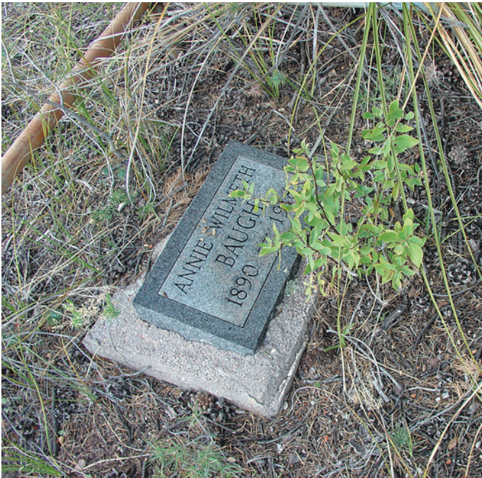
View 1 — Main (front)