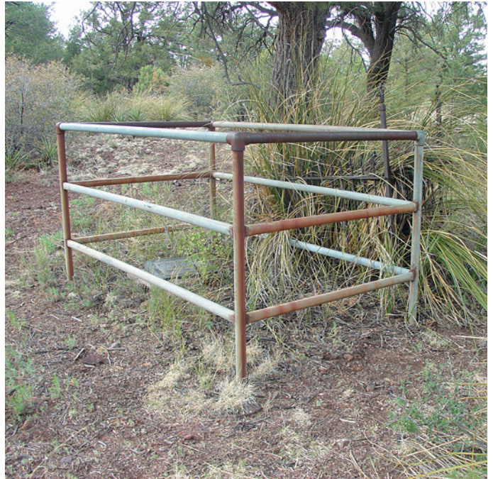
View 2 — Side (left)