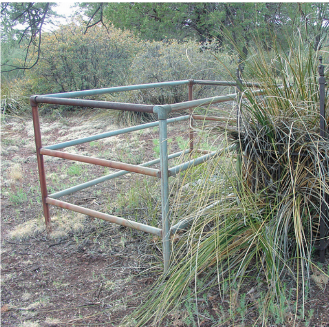
View 3 — Side (right)