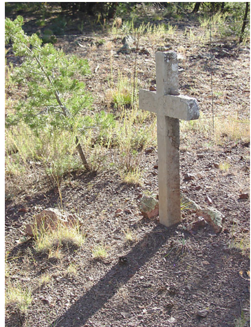
View 4 — Side (right)