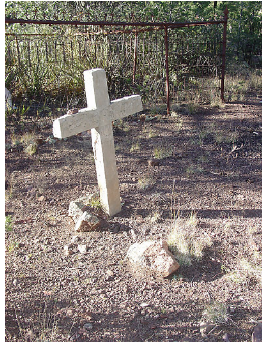
View 2 — Side (left)