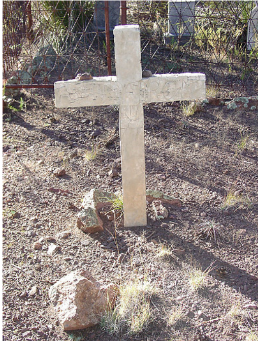
View 1 — Main (front)