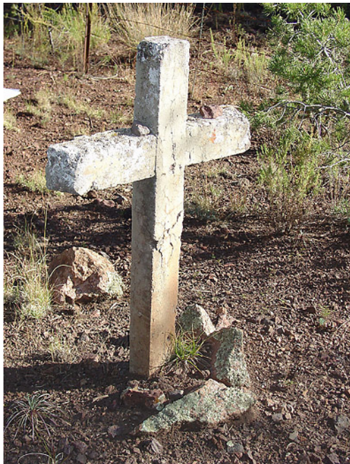
View 3 — Back